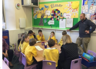
Parents visiting our classrooms