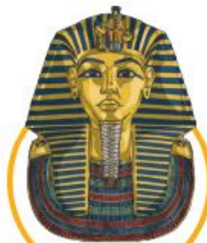
Tutankhamun's death mask

Knowledge Organiser LKS2 Ancient Egyptians