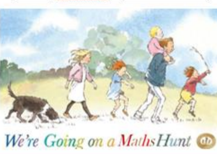
Some children, who feel confident, will be let loose. They will be able to explore deeper into the woods before returning to the group, to continue on with the journey.

Children will not be racing off ahead on a different journey.